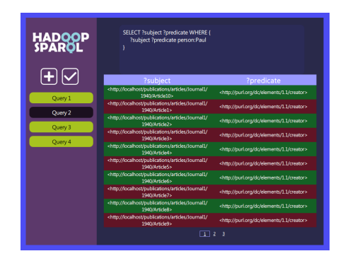
Fig. 4. HadoopSPARQL Query UI